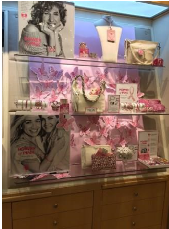
Brighton Collectibles Power of Pink Galleria & Willowbend

Ways to Give Every $1 donated is leverage 10x in medical care