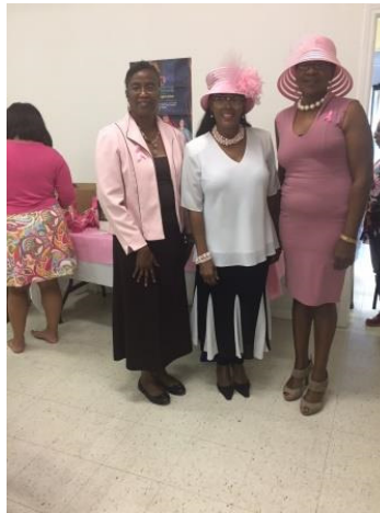
Mt. Moriah Breast Cancer Tea

Give the gift of a mammogram, surgery, chemotherapy, and radiation treatment to women in our community with breast cancer who will not survive without our help. The Bridge Breast Network is able to convert every $1 donated into $10 worth of medical care by partnering with providers like your doctor and imaging center. Breast cancer is deadly and without treatment low income