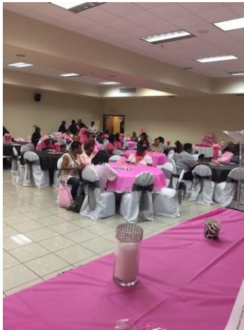
Mesquite Friendship Pink Party