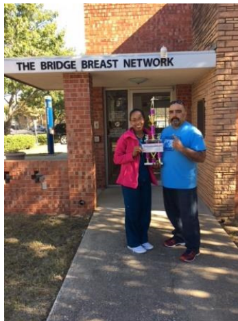
United Boxing Gym Breast Cancer Boxing Event