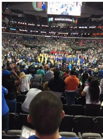
Dallas Mavericks Breast Health Awareness Night